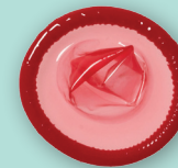
Condoms, for men or women